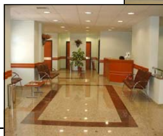
Lobby and outside view of new Outpatient Clinic