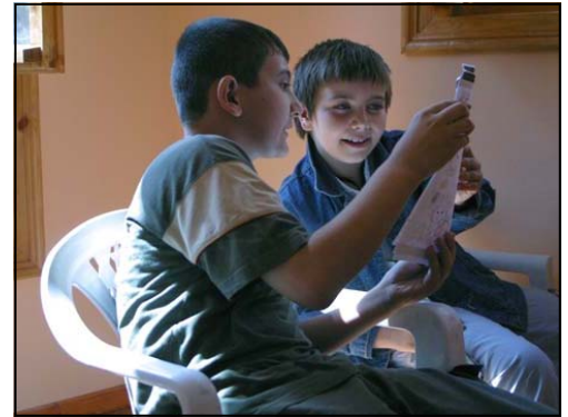
Do you believe it?!