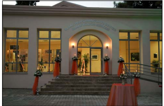
The new Blake Performing Arts Center