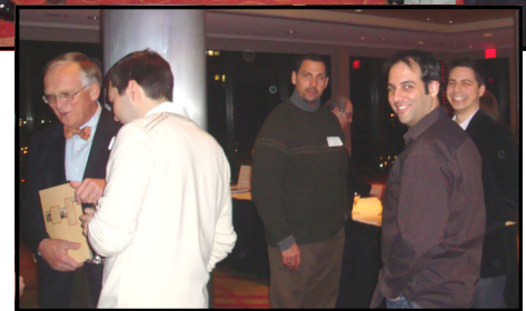
Above, February 6 Buluşalım! In Cambridge, MA where alums welcomed TAC's new biology teacher and ÜAA's new English teacher and Foreign Admissions Counselor; left, May 22 NYC Buluşalım! - dinner at The Turkish Kitchen.