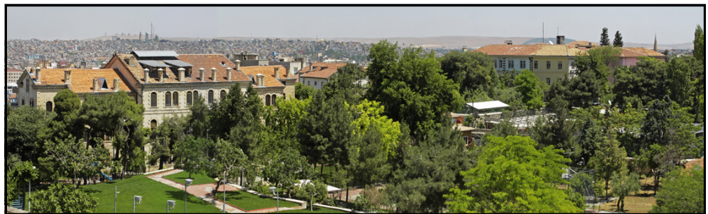
Panoramic view of the SEV American Hospital campus, Gaziantep