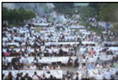
Some of the 800 graduates who attended TAC’s Homecoming 2010